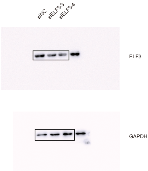
Figure 4 Supplement 1C